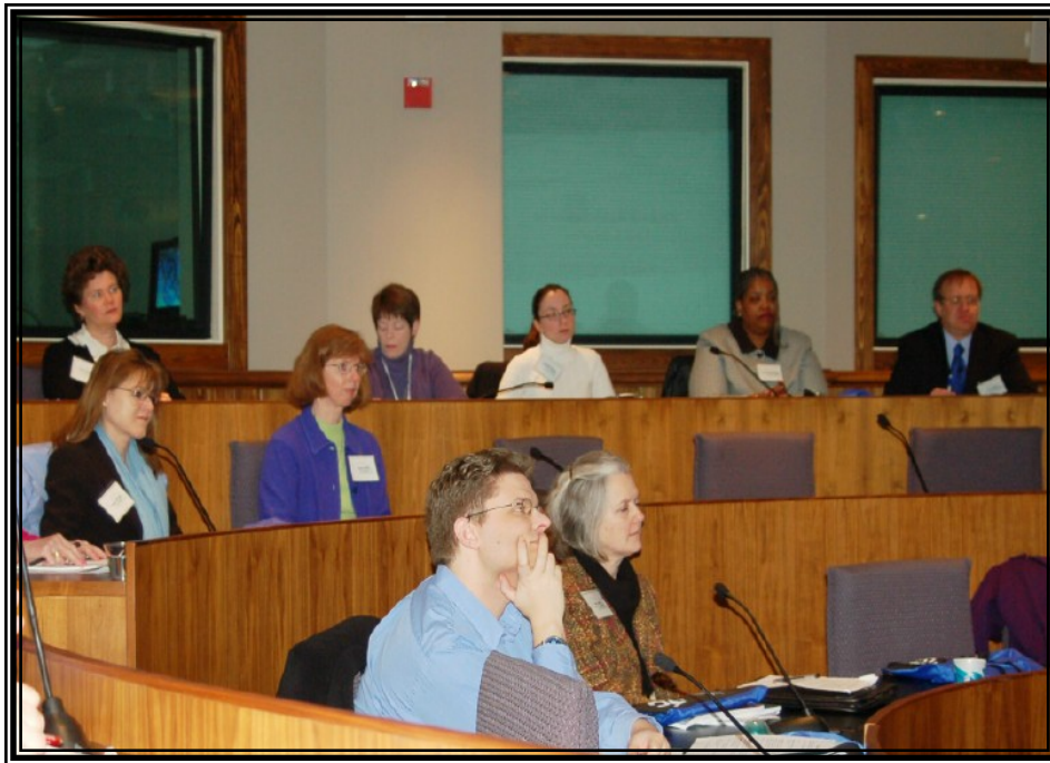
VALL members listening very intently to speakers at the Winter meeting -- Access to Court Records: Public vs Privacy Rights.